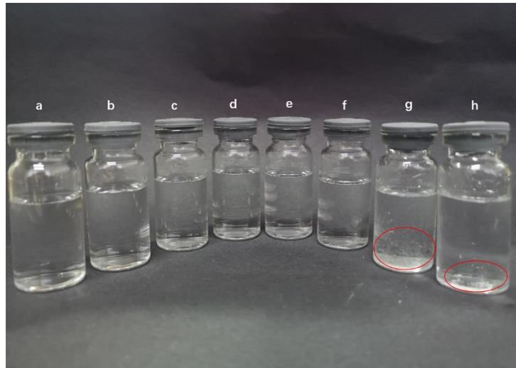
Figure S1. Optical image of the dissolution of ART.

a) 0.031 mg/mL ART-12%PEG4000; b) 0.063 mg/mL ART-12%PEG4000; c) 0.125 mg/mL ART-12%PEG4000; d) 0.248 mg/mL ART-12%PEG4000; e) 0.496 mg/mL ART-12%PEG4000; f) 0.982 mg/mL ART-12%PEG4000; g) ART-12%PEG4000 prepared with a target concentration of 2 mg/mL; h) ART aqueous solution prepared with a target concentration of 1 mg/mL.